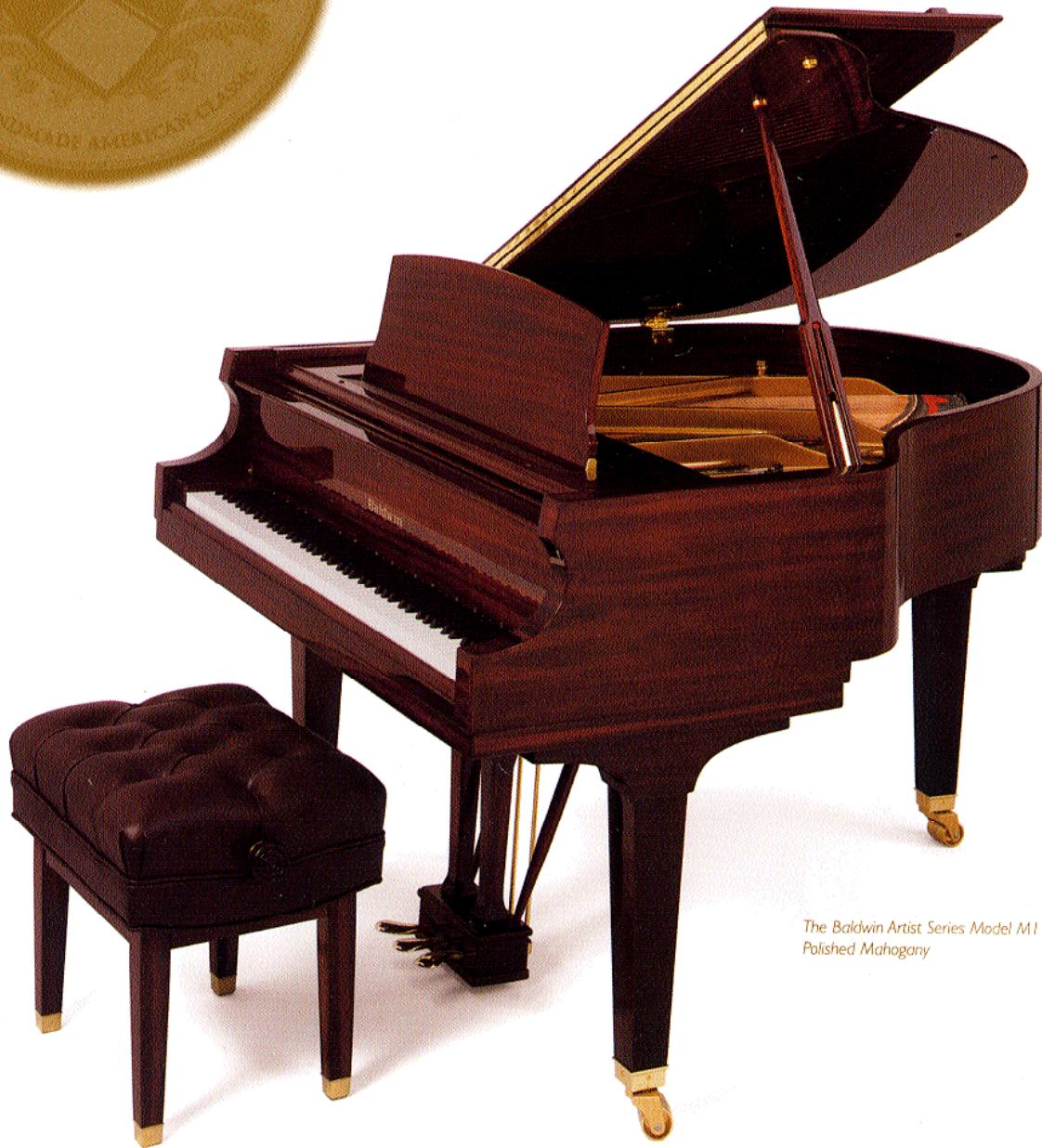
The Baldwin Artist Series Model M1 Polished Mahogany

M1 The Baldwin M1, a 5'2" Artist Grand, delivers a warm, distinctly American tone without compromising beauty and elegance. This handmade grand features complete artist-level craftsmanship and design so that it outperforms many larger pianos.